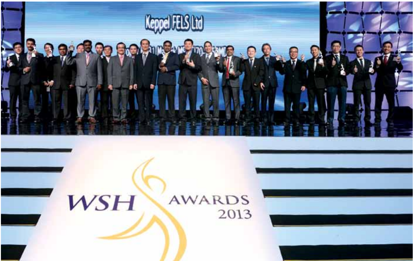
Keppel O&M won 29 Workplace Safety & Health Awards, with Keppel FELS clinching 15 SHARP awards in recognition of its excellent safety record of its newbuild projects

Receiving strong affirmation for its continued drive and performance in safety, Keppel Offshore & Marine (Keppel O&M) garnered a total of 29 Workplace Safety & Health (WSH) Awards conferred by the WSH Council and Singapore's Ministry of Manpower on 30 July 2013.