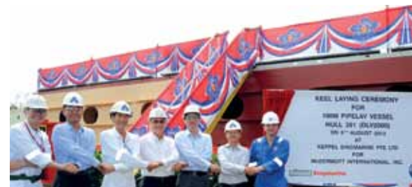
Keppel Singmarine marked the keel-laying ceremony of its high-specification deepwater pipelay vessel for McDermott International on 6 August 2013

will be fully equipped to support advanced deepwater pipe-laying operations at depths of up to 10,000 feet.