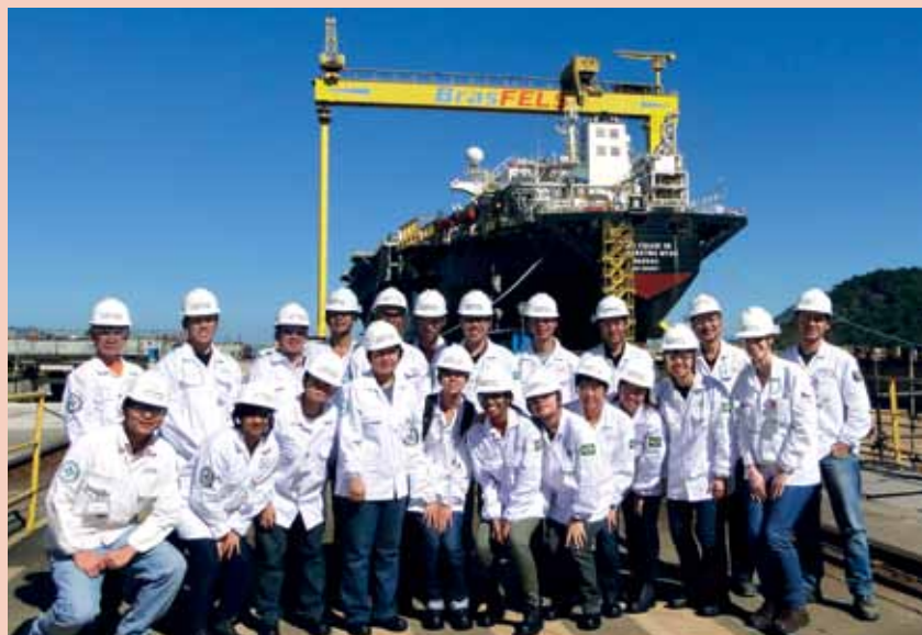
BrasFELS recently hosted students from NUS Faculty of Science students

Eager young minds from National University of Singapore's (NUS) Faculty of Science were at BrasFELS on 5 July 2013 to learn more about Keppel's operations in Brazil.