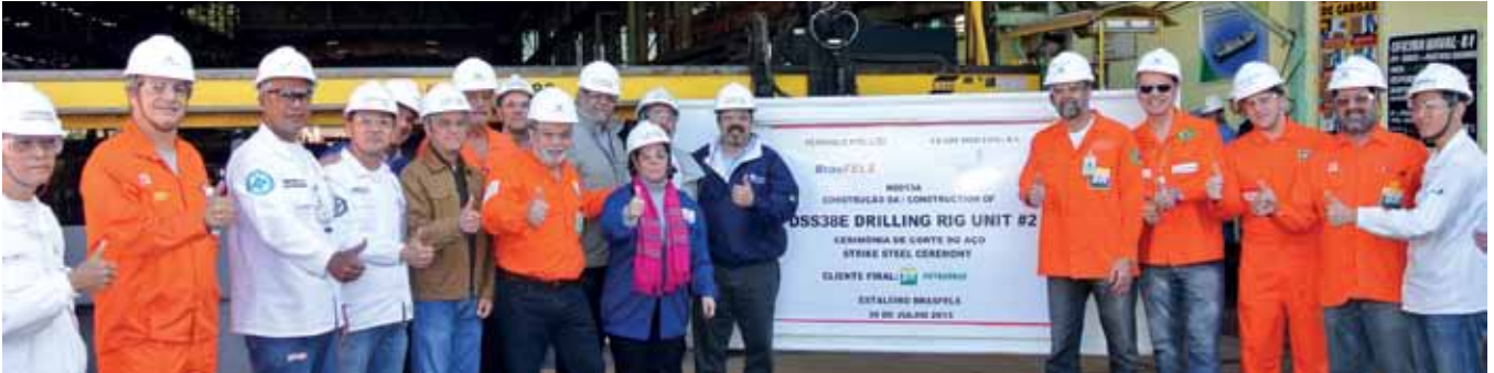
BrasFELS and Petrobras celebrate the strike steel ceremony of the second of six DSS™ 38E semi projects undertaken by the yard

BrasFELS, Keppel Offshore & Marine's (Keppel O&M) yard in Angra dos Reis, Rio de Janeiro, Brazil, is a hive of activity. Amongst the yard's ongoing projects are the newbuilding of six DSS™ 38E semisubmersible (semi) drilling rigs as well as the fabrication and integration of topside modules for four Floating Production Storage and Offloading (FPSO) units.