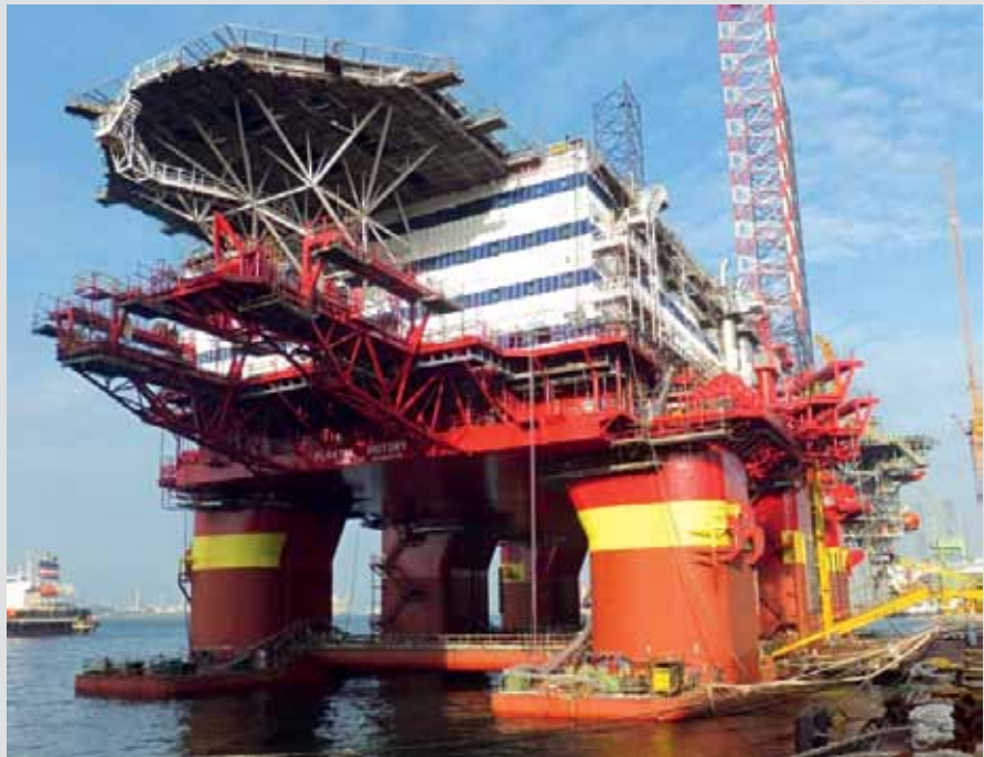
The fifth accommodation semi which Keppel FELS is building for Floatel will be a sister vessel to Floatel Victory (shown above). Built to Keppel's proprietary SSAU™5000NG design, it will be able to accommodate 500 persons, have ample recreation areas as well as office facilities while meeting the most stringent rules and regulations for worldwide operations

500 persons in one- and two-man cabins, the new semi will have state-of-the-art accommodation and recreational facilities that provide increased comfort for its occupants.