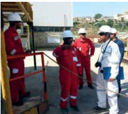
Keppel O&M cross-business unit auditing team conduct a yard tour at Caspian Shipyard Company in Azerbaijan to understand and evaluate its safety practices

Following the conclusion of the Keppel O&M cross-business unit audit exercise carried out