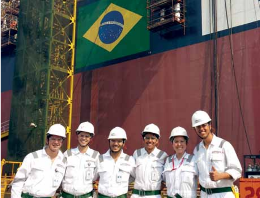
Through a rigorous work and study programme in Singapore, the young Brazilian Keppelites gained a broader understanding of Keppel and the offshore and marine industry

It is not always that you meet kindred spirits far away from home. But, to their pleasant surprise, nine young Brazilian Keppelites found much common ground with their colleagues from across the globe.