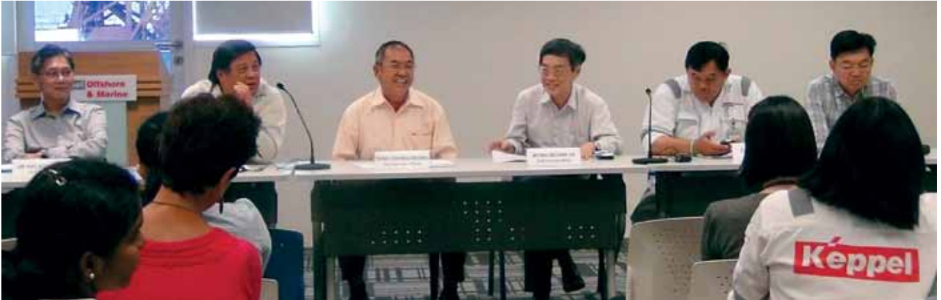
Keppel O&M's senior management enjoying a robust discussion with female Keppelites

To create a better and a more conducive working environment for females at Keppel Offshore & Marine (Keppel O&M), a staff engagement session with Keppel O&M senior management was held on 8 July 2013, attended by 140 female employees from the Production and Engineering departments across the group.