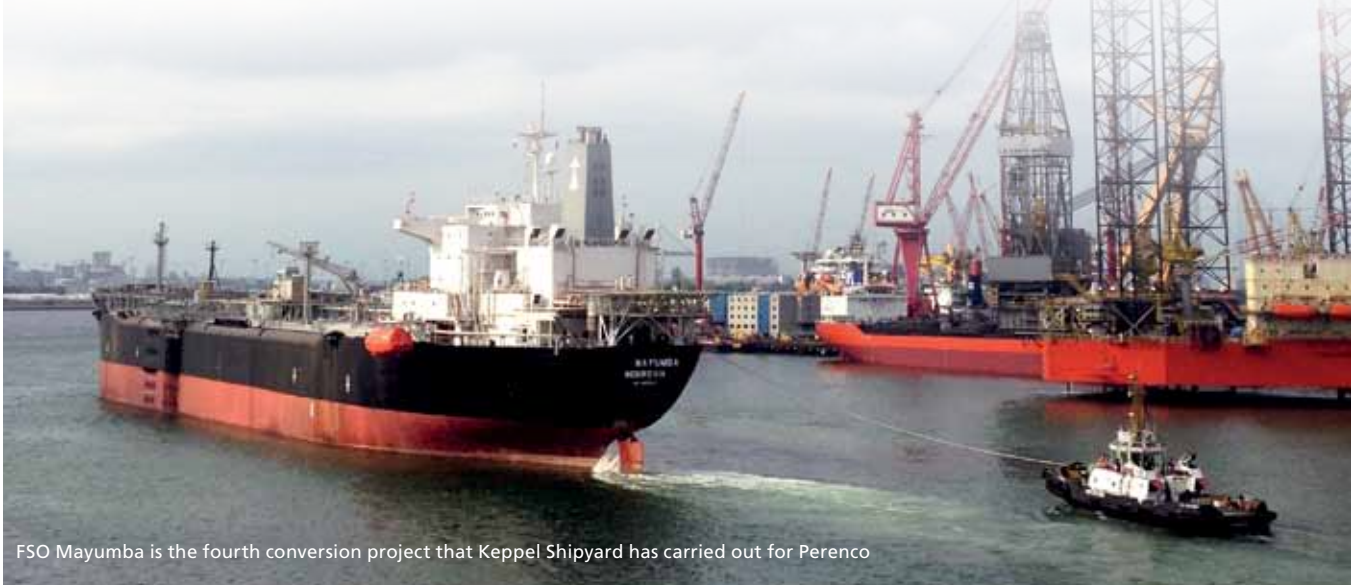
FSO Mayumba is the fourth conversion project that Keppel Shipyard has carried out for Perenco