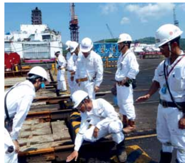
Apart from conducting safety workshops, Keppel O&M HSE team also conducted walkabouts at Keppel Subic Shipyard and Keppel Batangas Shipyard to understand the conditions of the yards