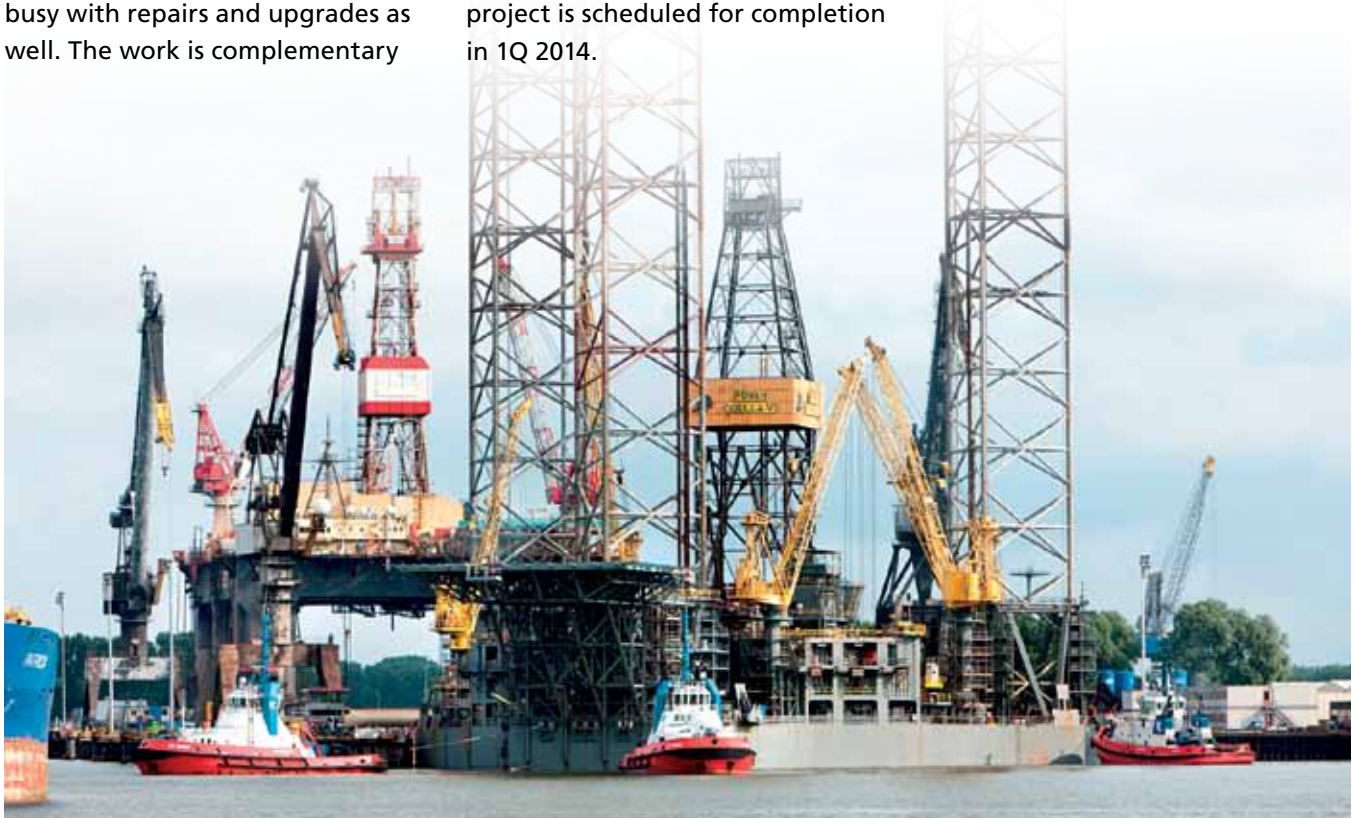
Rowan Gorilla VI being towed into Keppel Verolme

Keppel Verolme is also completing a full SPS programme for Saipem on the semi Scarabeo 5. The yard's scope of work comprises the overhaul of the thrusters and all anchor winches, upgrading of the top drive and various modification and repairs. Scarabeo 5 is scheduled for delivery in September 2013.