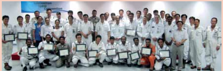
16 teams from Keppel Shipyard participated in Keppel O&M's annual safety Innovation Team (SIT) Conventions

Sixteen teams from Keppel Shipyard competed to clinch the award for the most innovative project at the yard's convention on 12 June 2013. The winning teams impressed the judges with their novel ideas, which included the Cable Stripping Tool, a compact and ergonomically designed machine that enables users to strip out cables with minimum effort, as well as the Cable