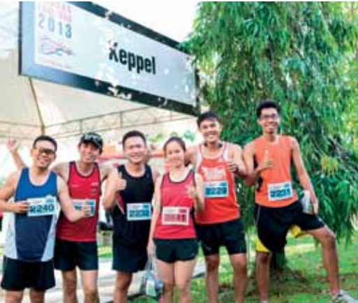
Over 50 Keppel O&M participants joined some 15,000 Singaporeans at the Jurong Lake Run 2013

Keppel Offshore & Marine (Keppel O&M) is the proud platinum sponsor of the Jurong Lake Run 2013, an annual sporting fundraising event organised by