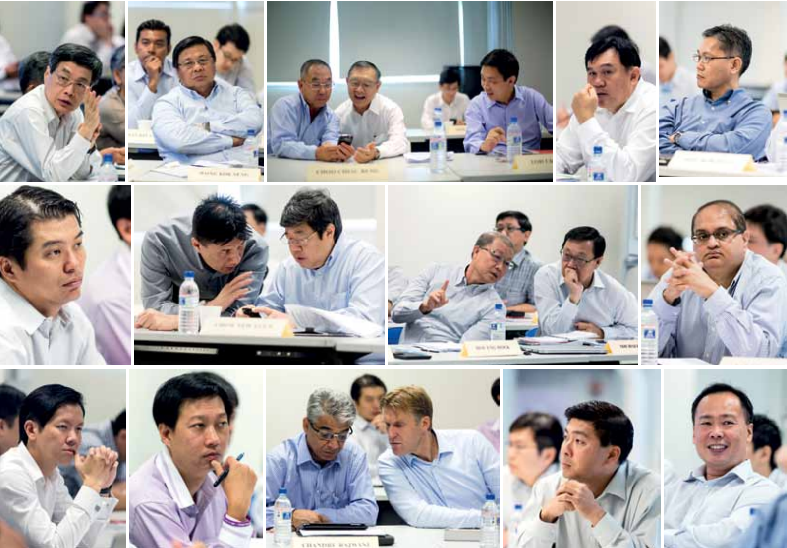
It was two days of intense but fruitful discussions among the top management of Keppel O&M's business units in Singapore and overseas during the recent round of strategy meeting

Keppel Offshore & Marine (Keppel O&M) held its second strategy meeting of the year on 12 and 13 August 2013. This keeps the momentum going, following the first strategy meeting in February, among the top executives of Keppel O&M in Singapore and overseas in charting the way forward for the group as the competitive landscape intensifies.