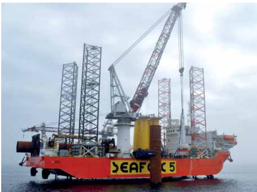
Seafox 5 and crew have delivered a record-breaking turnaround time of less than six days from departure from port of call to the installation of four foundations in Dan Tysk wind farm in the German sector of the North Sea

Within a few short months of arriving at Dan Tysk wind farm in the German sector of the North Sea, Seafox 5, the world's first-of-its-kind offshore wind turbine installer, has successfully installed half of the total 80 wind turbine foundations.