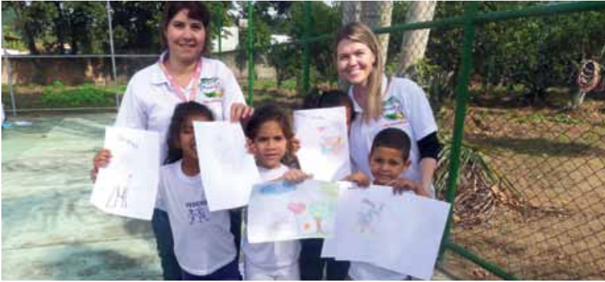
BrasFELS employees opening a window to the world through reading and drawing with children of needy families

It was a wintry day turned sunny as the BrasFELS volunteers and children spent a fun-filled day reading and drawing.