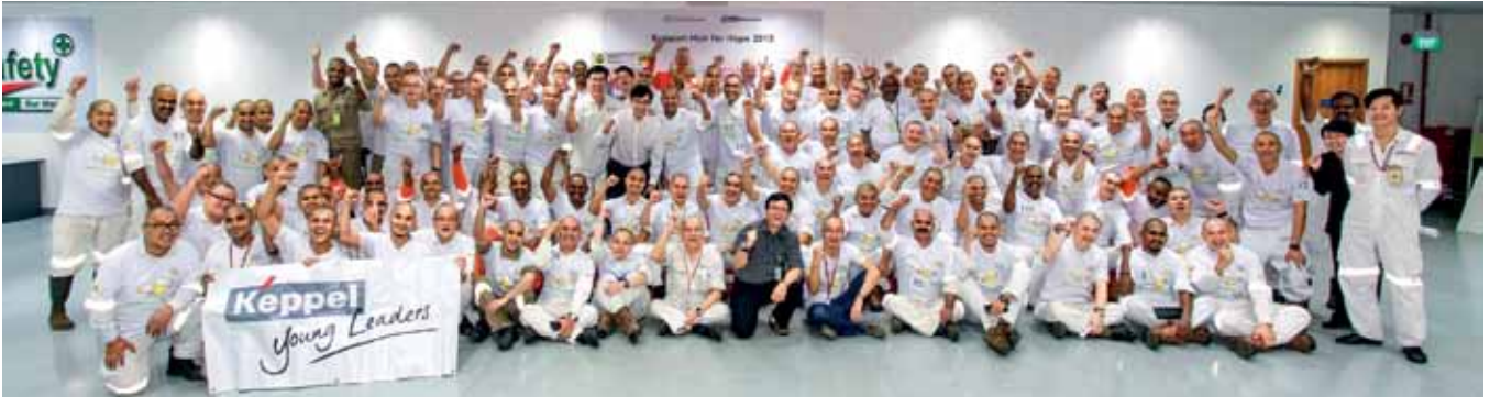
Only the Tough go Bald! 107 Keppel Shipyard staff and their customers rallied together to have their heads shaved on 26 June 2013 in support of Hair for Hope, a fundraising event by Children's Cancer Foundation. The "hair-razing" event chalked up more than S$20,000 in donations