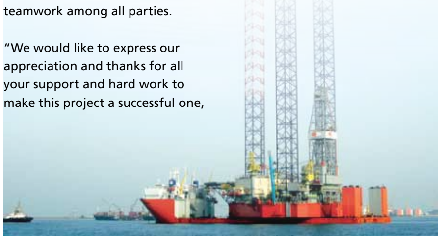
Through good teamwork between Keppel FELS and Arabian Drilling Company, the KFELS B Class jackup rig ARABDRILL 50 was completed safely and promptly, and commenced operations in offshore Saudi Arabia for Saudi Aramco

and we look forward to have same spirit of work and relationship for the ongoing project ARABDRILL 60."