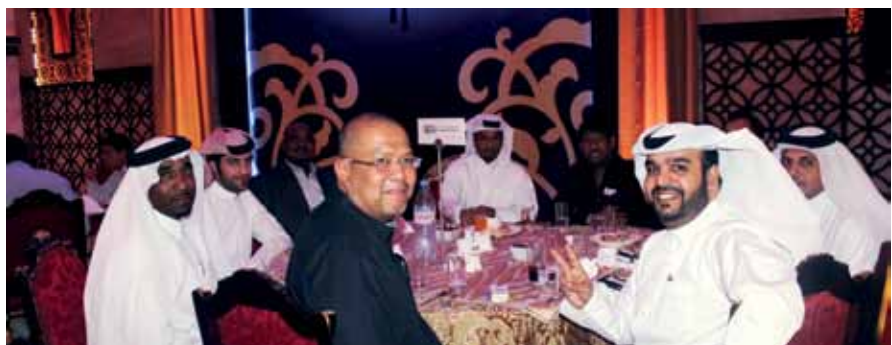
N-KOM gathered with vendors, customers and employees for Ghabga during the Muslim holy month of Ramadan

cluster of shipyard facilities located in the Ras Laffan Industrial City in Qatar. Since its inception in 2010, N-KOM has built up a creditable track record of over 100 projects comprising LNG and liquefied petroleum gas (LPG) carriers, tankers, container ships, offshore support vessels, buoys and jackup rigs.