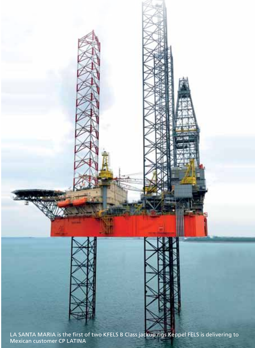
LA SANTA MARIA is the first of two KFELS B Class jackup rigs Keppel FELS is delivering to Mexican customer CP LATINA

In addition to the second rig for CP LATINA, Keppel FELS is also building for the Mexican market one KFELS B Class jackup rig for Parden Holding, two for PEMEX and five for Grupo R. Its sister yard, Keppel AmFELS in Brownsville, Texas, delivered a jackup rig to Perforadora Central in April 2013 with another due for delivery in 1Q 2014.