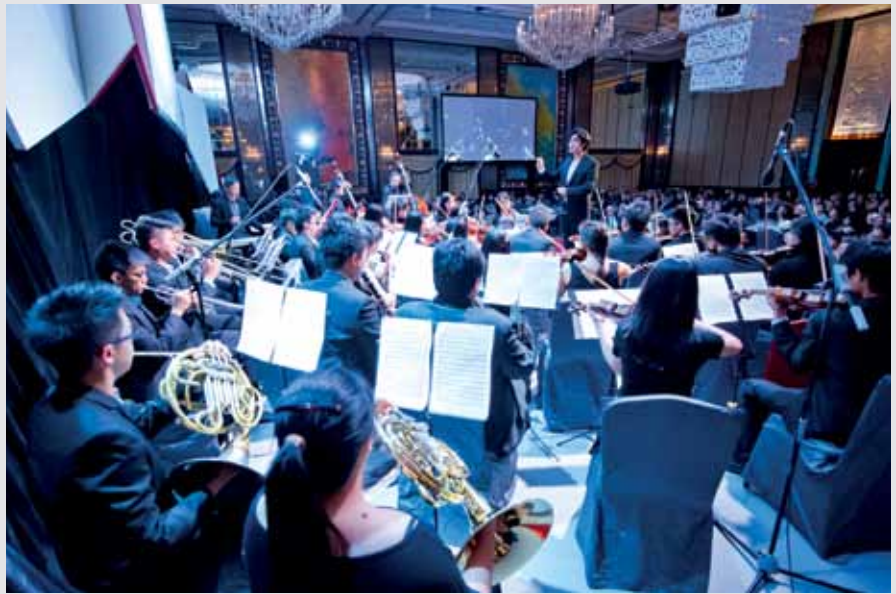
Guests were mesmerised by performances by The Young Musicians' Foundation Orchestra

Keppel Corporation, proudly declared, "When I grow up, I want to be a Keppelite!"