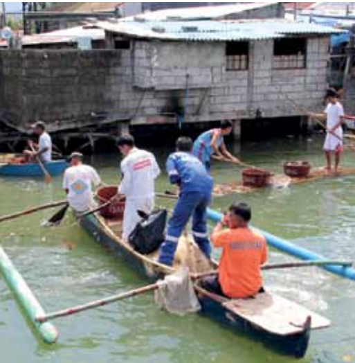
Volunteers from Keppel Subic Shipyard helped to carry out an extensive clean-up at the Asinan and Wawandue Rivers

Clogged with waste, the waters of the Asinan and Wawandue Rivers in Subic, Zambales, in the Philippines, flood the river banks when the rainy season comes along. This is one of the unintended effects of population growth in the area as a result of economic development.