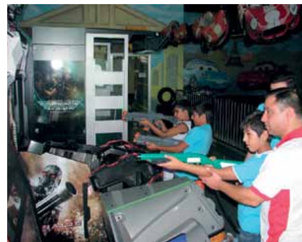
Caspian Shipyard Company volunteers and children from the Special Boarding School for Children with Speech Impediment battling it out in the arcade

In addition to organising outings for the children, CSC has helped the school by taking care of some of their needs such as providing 20 new dining tables and refurbished chairs for the school's canteen.